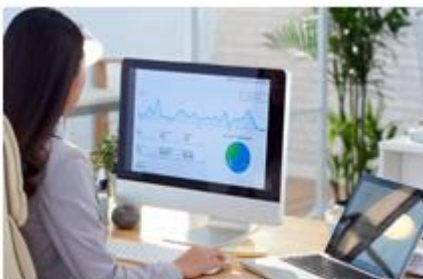
Back office Operations

Some of the amazing services Unicorn OPS currently offers to some of our Esteemed clients are