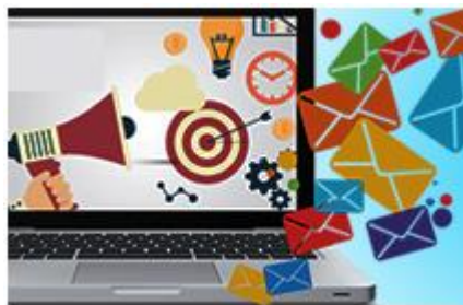
Sms / Email campaigns