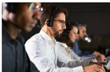
Call Center Ops